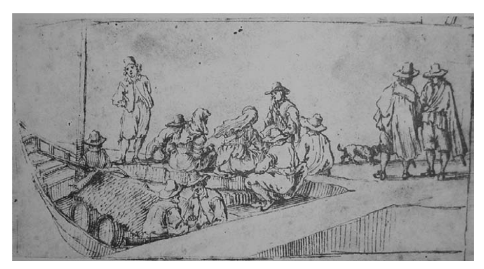
Fig. 5 – Stefano della Bella, detail of a large sheet of sketches with figure studies and harbour scenes copied after Baccio del Bianco, pen and ink on paper, Istituto Nazionale per la Grafica, Rome.

However, it was a huge surprise to notice in Baccio's drawings in the Uffizi a particular feature that was not mentioned in the previous literature. Some of them, both the popular (Fig. 6) and the naval scenes (Fig. 3), are created out of cuttings and pieces stuck together, 40 the extreme precision of their production (the cuttings are barely visible) suggesting a "retro taste for workmanship." <sup>41</sup> I was not able to identify cuttings in the precise drawings by Baccio that Stefano copied, and therefore prove without any doubt the impossibility of the draughtsmen working simultaneously, but I believe that Baccio's working method here described is proof enough that his creative process involved studio elaboration. It proves not only the ambiguity of the term dal vivo, but also how little we really know of actual drawing practices in early seventeenthcentury Florence, 42 suggesting that we should read with care Baldinucci's account of Baccio's practice of drawing in the open-air: