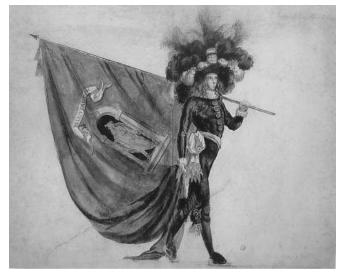
Fig. 1 – Baccio del Bianco, Costume study , pen and ink over black chalk and coloured washes on paper, GDSI, inv. 1329 A.

In the fashioning of these political propagandistic tools that arts and artists were to become, a new conception of art came to dominate in Florence in the last decades of the sixteenth century, articulated through a clear emphasis on the manual dimension of the arts. In a period when throughout Europe, and in Italy especially, crafts were devalued more and more as part of a general trend to downgrade manual labour and assert art's nobility through its association with the liberal arts, this might come as a surprise, but must be understood as a conscious position adopted by the Medici rulers as part of their very carefully staged-managed process of taking control over the arts and submitting them to their authority.