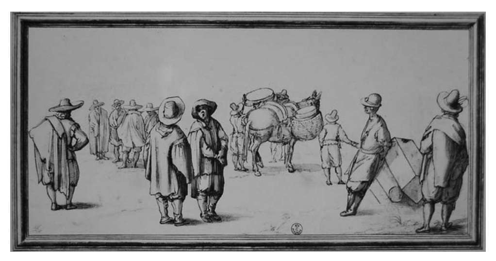
Fig. 6 - Baccio del Bianco, Figure study, pen and ink, wash on paper, GDSI, inv. 14376 F.

but in this group of artists it acquires a completely different value, mainly because it does not precede a finished oeuvre (except in the case of drawings for engravings) and therefore it does not comply with the needs of the different stages in the creation of a painting, and thus with the types of drawing which had become traditional in Florence: pensiero , figure study, composition study, cartoon.