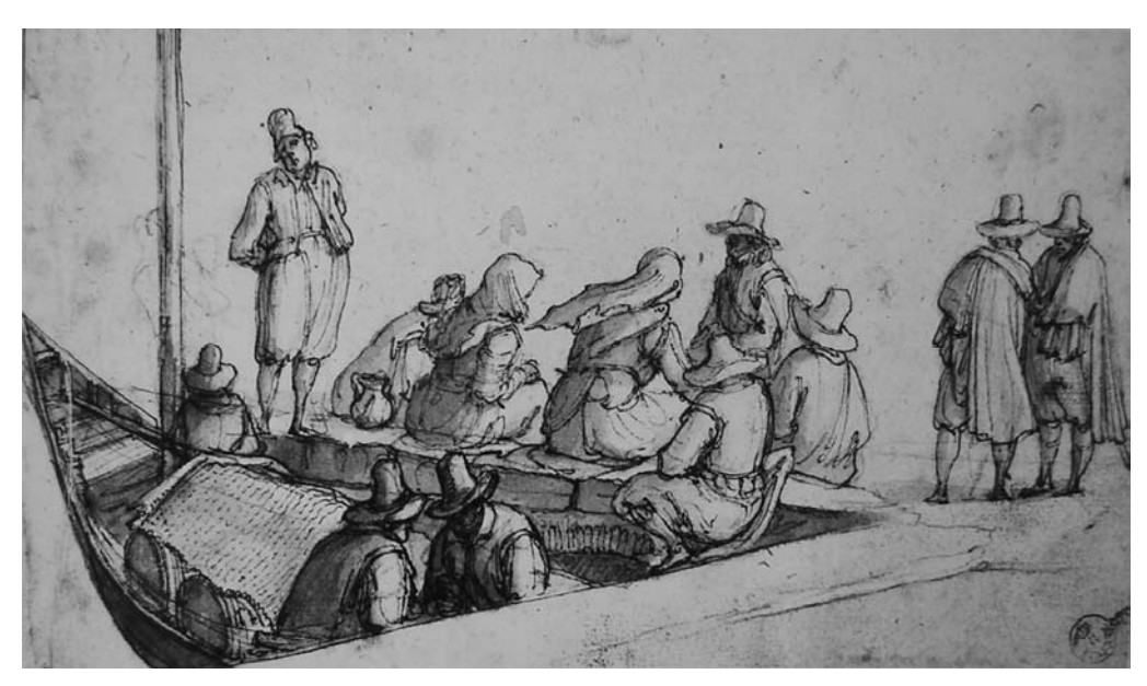
Fig. 4 – Baccio del Bianco, Figure study, pen and ink, wash on paper, GDSI, inv. 3350 F.

Baccio del Bianco's drawings done in the harbour of Livorno, probably in the late 1620s or early 1630s (Fig. 4),<sup>37</sup> make a very interesting case for the analysis of the role of drawing dal vivo. It has been a subject of dispute among scholars whether some of Stefano della Bella's drawings (Fig. 5), practically identical in pose and composition with some of Baccio's here discussed, were done in the same moment and place by the artist working alongside his slightly older companion.<sup>38</sup> Phyllis Dearborn Massar argued against this, claiming that even working together the two would have picked slightly different positions and moments of the action, especially since the characters represented were not posing, but engaged in their daily activities. She thinks that Stefano della Bella's sketches were done by the "young [artist], feeling his way and copying the compositions of his friend and teacher of perspective, Baccio del Bianco." Moreover, I believe that precisely the large, inconvenient to carry size of the sheets (420 x 315 mm.), on which Stefano crowds many of the motifs found in Baccio's drawings, is an argument that Stefano della Bella's drawings were not done in open-air, but copied after Baccio's.